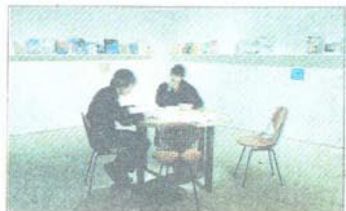
'The Reading Room, One'

The display of publications is part of a high-design scheme for the room, which includes a reader-friendly contemporary table and Eames chairs from the school's collection. They cluster beneath a "Frisbi" lighting fixture by leading designer Achille Cas-